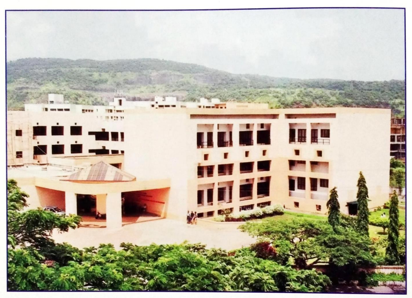
A panaromic view of SIESCOMS campus at Nerul, Navi Mumbai